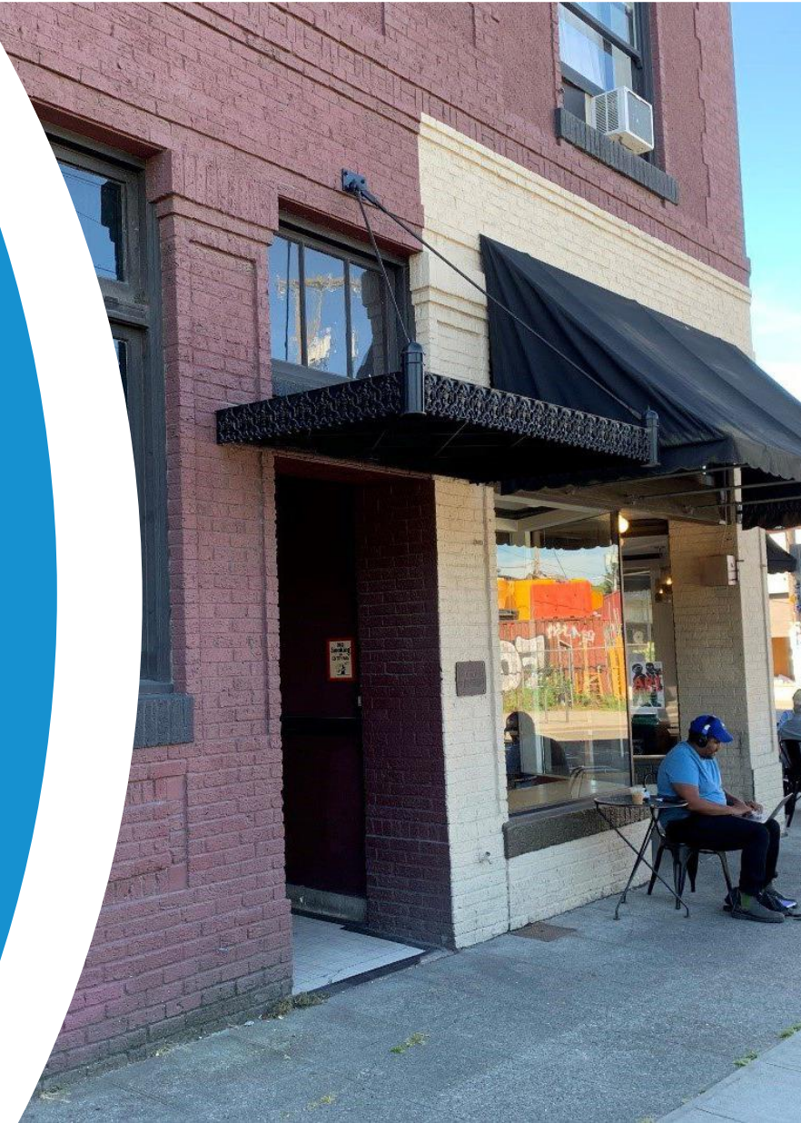
Fantagraphics Bookstore and Gallery in Georgetown.