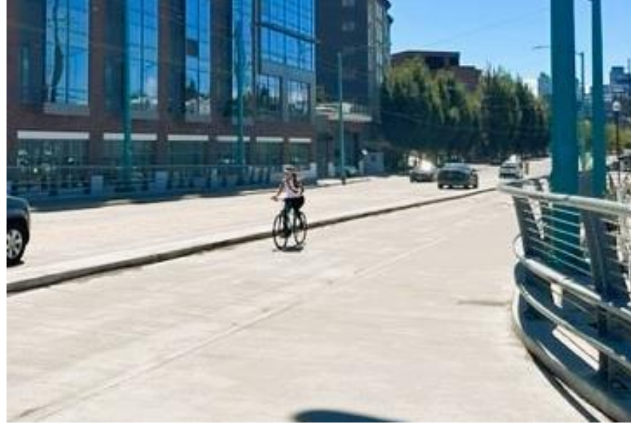
Top to bottom: Fairview Ave N Bridge, with two-way PBL; Repaving on E Madison St as part of Madison RapidRide G Line project; Repaved SW Avalon Way with new PBL.