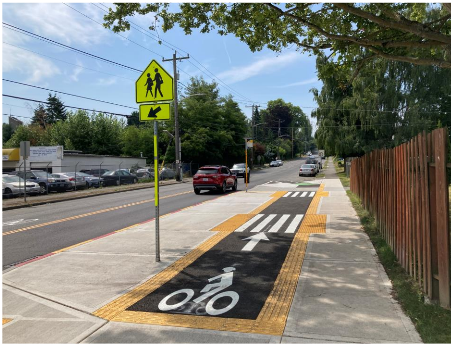
51st Ave S and Renton Ave S Traffic Safety Enhancements (Neighborhood Street Fund)