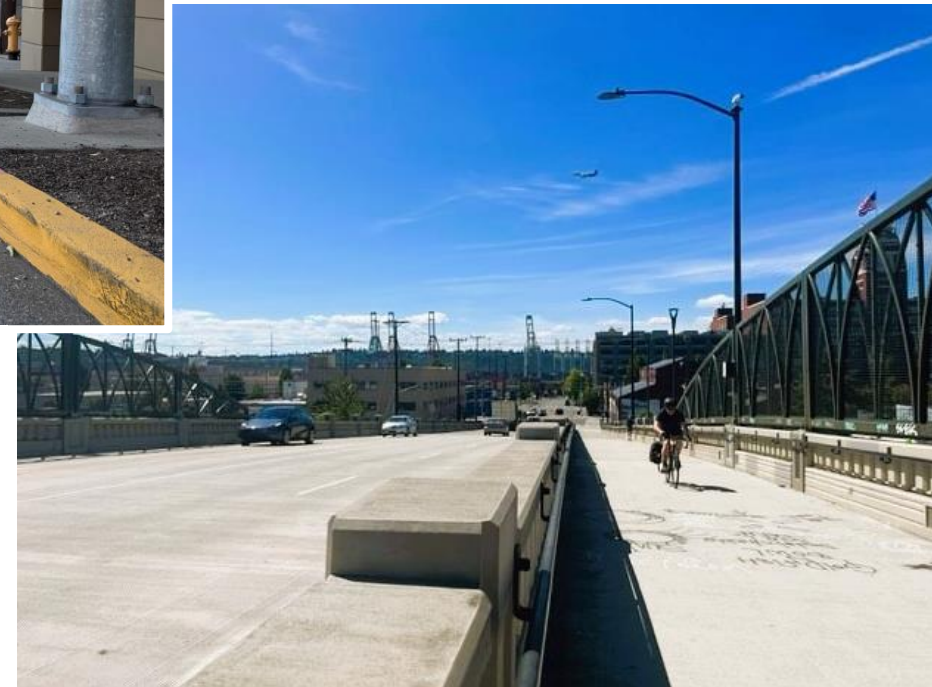
Top: John Lewis Memorial Bridge Bottom: Lander St Bridge