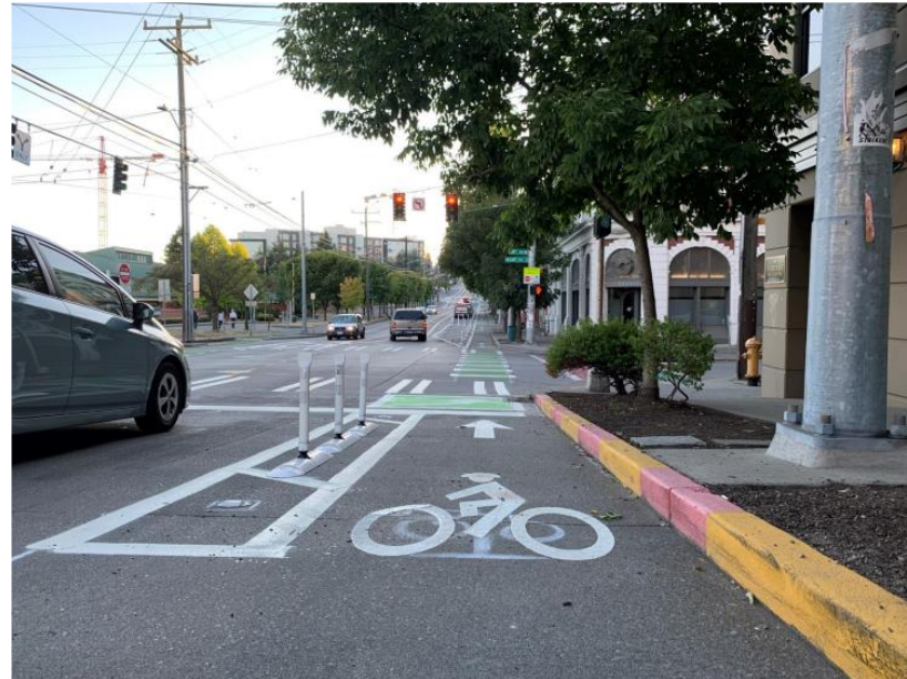
Transit spot improvement for bicycle safety at Westbound Yesler Way and 14th Ave