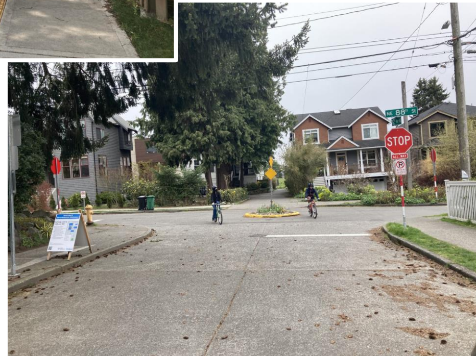
Northgate to Maple Leaf Neighborhood Greenway, connecting to other bike routes and Northgate Link light rail station