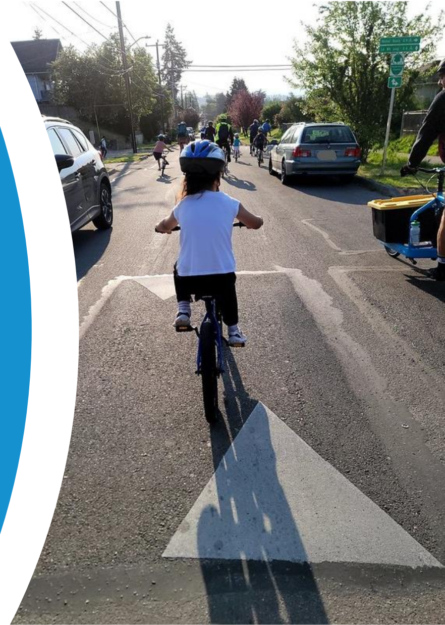
Seattle Bike Bus event; child biking over speed hump