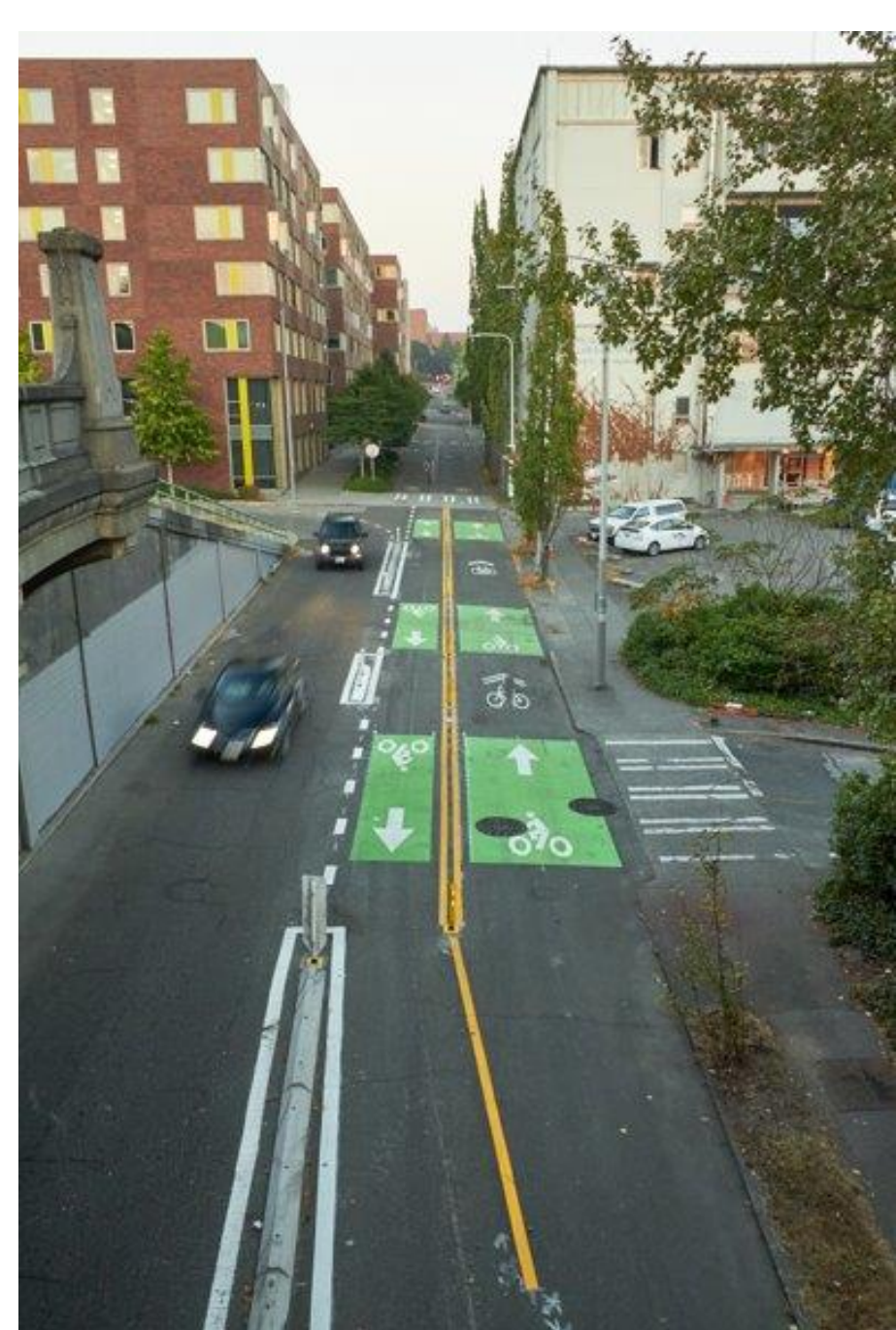
Bike spot improvement/barriers on N 40 th St.